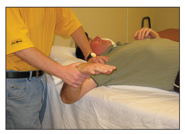
Figure 6. Sleeper Stretch 6, passive stretch performed in supine, with stabilization of the scapula.