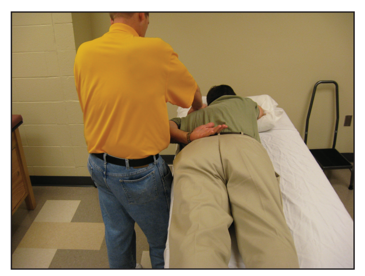
Figure 2. Sleeper Stretch 2, performed in prone with scapular stabilization.